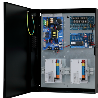
T1AXK3F2SD with two (2) A1210 DIN Rail is included