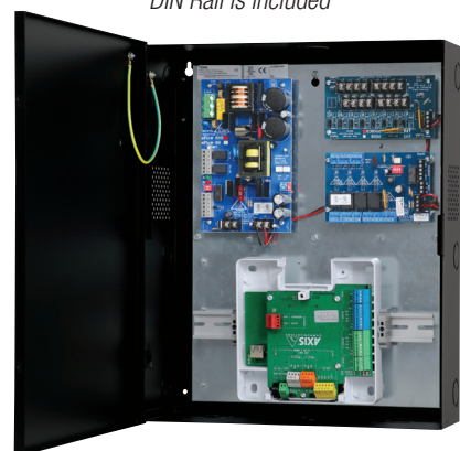
T1AXK3F2SD with one (1) A1610 DIN Rail is included

Axis Communications boards are not included