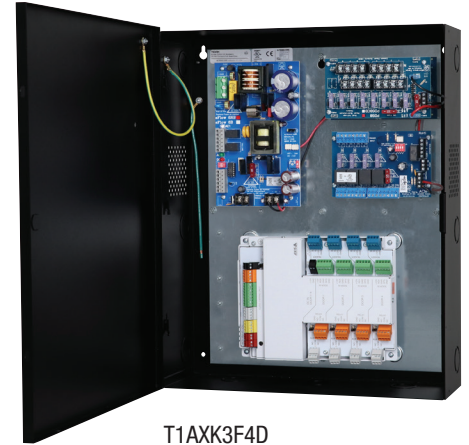
T1AXK3F4D Axis Communications boards are not included

Altronix T1AXK3F4D kit consists of Trove1 enclosure, TDR1 DIN Rail/Altronix backplane with one (1) 24VDC @ 6A power supply/charger, one (1) PTC access power controller, one (1) voltage regulator and one (1) dual input PTC power distribution module. This kit also accommodates one (1) A1710B for up to four (4) doors in a single enclosure. Trove simplifies board layout and wire management, reduces installation time and labor costs.