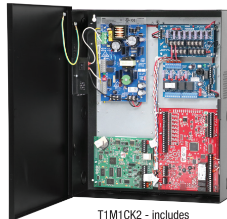
T1M1CK2 - includes eFlow4NB, PDS8, VR6, ACM4, wire harnesses and wire magnets