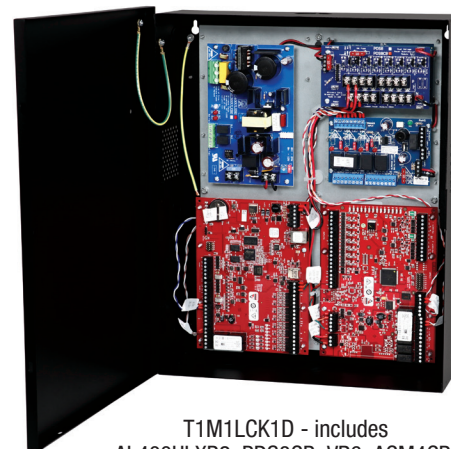
T1M1LCK1D - includes AL400ULXB2, PDS8CB, VR6, ACM4CB, wire harnesses and wire magnets