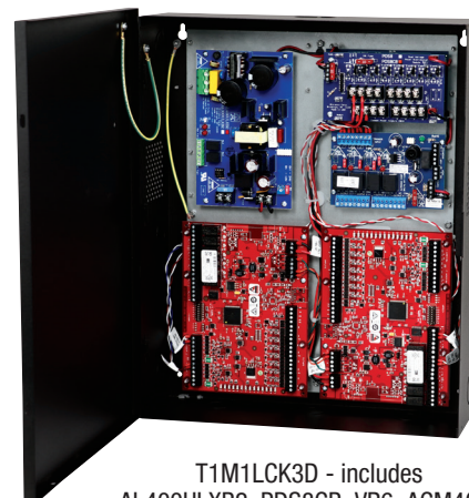
T1M1LCK3D - includes AL400ULXB2, PDS8CB, VR6, ACM4CB, wire harnesses and wire magnets