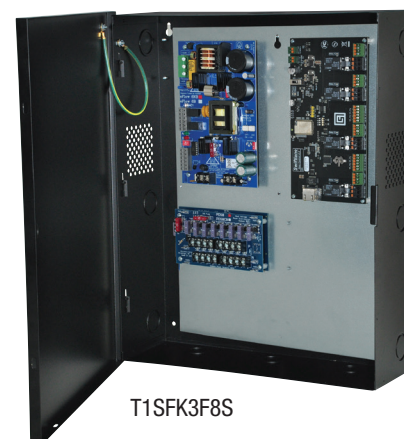
Swiftlane boards sold separately.

Altronix T1SFK3F8S kit consists of Trove1 enclosure, TSF1 Altronix/Swiftlane Controls backplane with one (1) 12VDC or 24VDC @ 6A power supply/charger 12VDC voltage regulator, eight (8) fuse protected output dual voltage power distribution module. This kit also accommodates one (1) Swiftlane Controls Door Controller 5 (SL-DCU-5) board. Trove simplifies board layout and wire management, reduces installation time and labor costs.