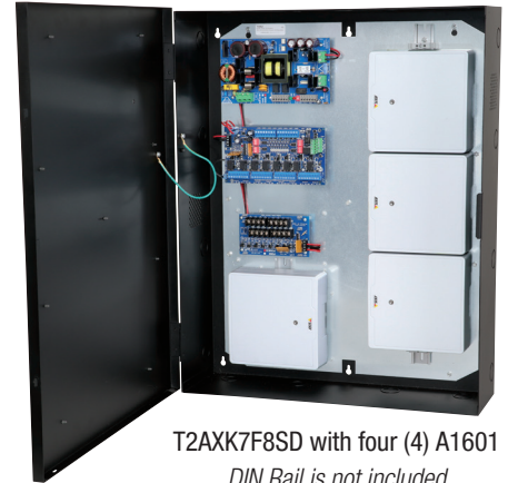
T2AXK7F8SD with four (4) A1601 DIN Rail is not included