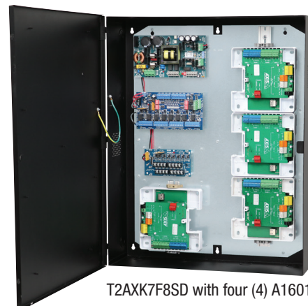
T2AXK7F8SD with four (4) A1601 DIN Rail is not included