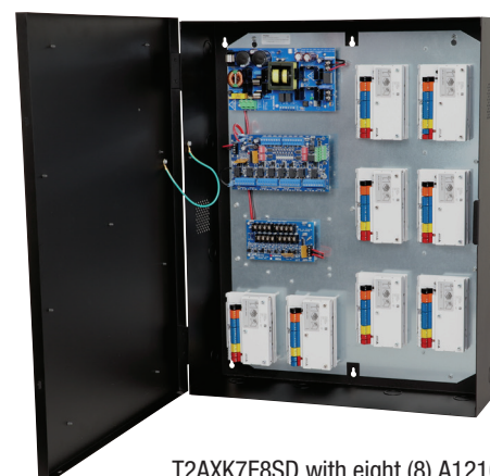
T2AXK7F8SD with eight (8) A1210

Axis Communications boards are not included