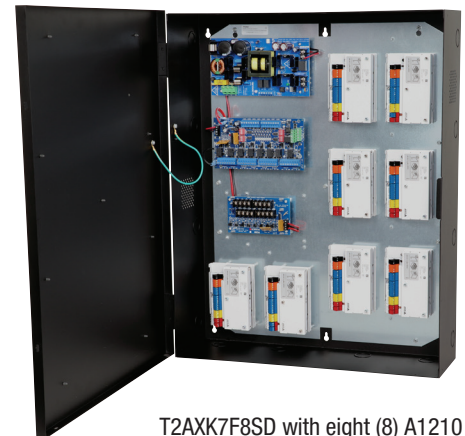
T2AXK7F8SD with eight (8) A1210

Axis Communications boards are not included