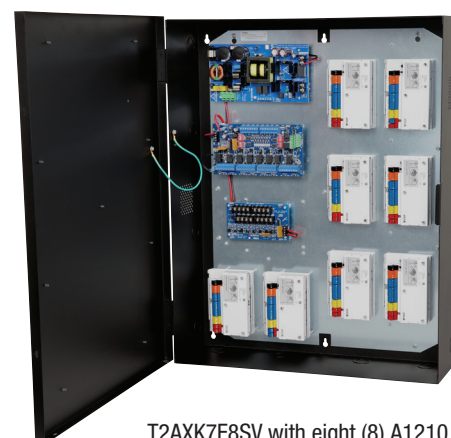
T2AXK7F8SV with eight (8) A1210

Axis Communications boards are not included