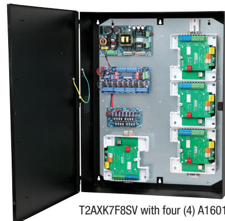
T2AXK7F8SV with four (4) A1601 DIN Rail is not included