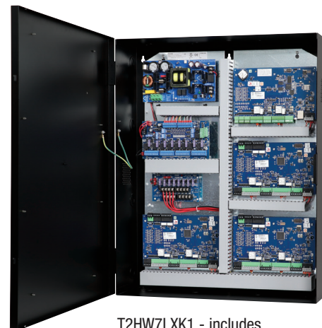
T2HW7LXK1 - includes AL1024ULXB2, ACMS8, VR6, PDS8, wire harnesses and finger duct