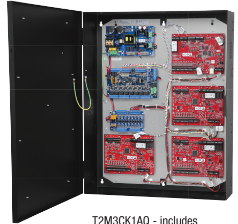
T2M3CK1AQ - includes eFlow6NB, LINQ8ACM8, PDS16, wire harnesses and management

AccessNsite, Avigilon, BadgePass, BluBox, Feenics, Genetec, Identocard, IMRON, Johnson Controls, Kastle, Keri Systems, Lenel/S2, LockState, Maxxess, Midpoint Security, NLSS, Open Options, Panasonic i-PRO MonitorCast, Quintron, RS2, S2 Security, Schneider Electric, Vanderbilt