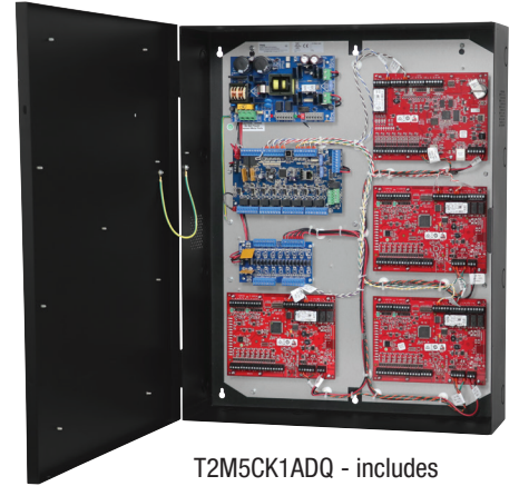
T2M5CK1ADQ - includes eFlow102NB, LINQ8ACM8CB, PDS16CB, wire harnesses and management

AccessNsite, Avigilon, BadgePass, BluBox, Feenics, Genetec, Identocard, IMRON, Johnson Controls, Kastle, Keri Systems, Lenel/S2, LockState, Maxxess, Midpoint Security, NLSS, Open Options, Panasonic i-PRO MonitorCast, Quintron, RS2, S2 Security, Schneider Electric, Vanderbilt