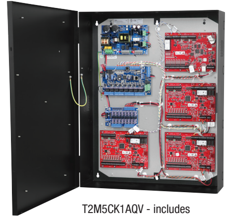
T2M5CK1AQV - includes eFlow102NBV, LINQ8ACM8, PDS16, wire harnesses and management

AccessNsite, Avigilon, BadgePass, BluBox, Feenics, Genetec, Identocard, IMRON, Johnson Controls, Kastle, Keri Systems, Lenel/S2, LockState, Maxxess, Midpoint Security, NLSS, Open Options, Panasonic i-PRO MonitorCast, Quintron, RS2, S2 Security, Schneider Electric, Vanderbilt