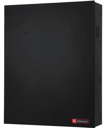
T2M5PCK1 - includes eFlow102NB, PDS8, wire harnesses and wire magnets