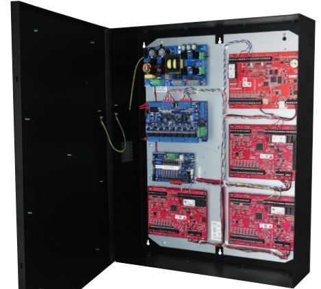
T2M7CK2Q - includes eFlow104NB, LINQ8ACM, VR6, LINQ8PD, wire harnesses and management