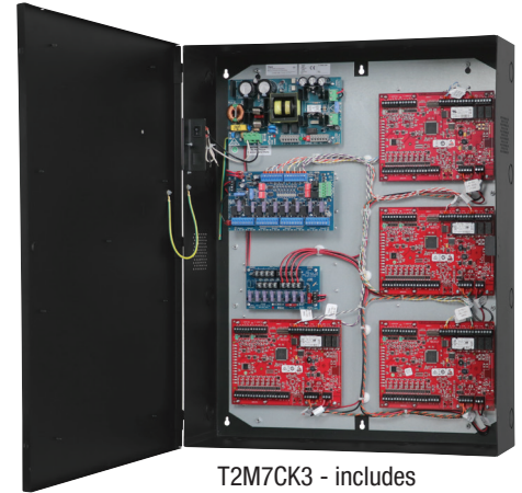
T2M7CK3 - includes eFlow104NB, ACMS8, VR6, PDS8, wire harnesses and management

AccessNsite, Avigilon, BadgePass, BluBox, Feenics, Genetec, Identicon, IMRON, Johnson Controls, Kastle, Keri Systems, Lenel/S2, LockState, Maxxess, Midpoint Security, NLSS, Open Options, Panasonic i-PRO MonitorCast, Quintron, RS2, S2 Security, Schneider Electric, Vanderbilt