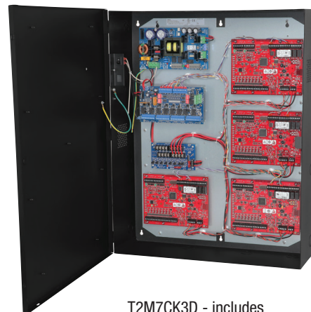
T2M7CK3D - includes eFlow104NB, ACMS8CB, VR6, PDS8CB, wire harnesses and management