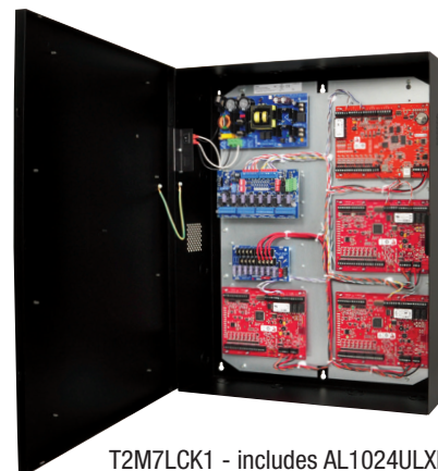
T2M7LCK1 - includes AL1024ULXB2, ACMS8, VR6, PDS8, wire harnesses and wire magnets Mercury boards are not included

AccessNsite, Avigilon, BadgePass, BluBox, Feenics, Genetec, Identocard, IMRON, Johnson Controls, Kastle, Keri Systems, LockState, Maxxess, Midpoint Security, NLSS, Open Options, Panasonic i-PRO MonitorCast, Quintron, RS2, S2 Security, Schneider Electric, Vanderbilt