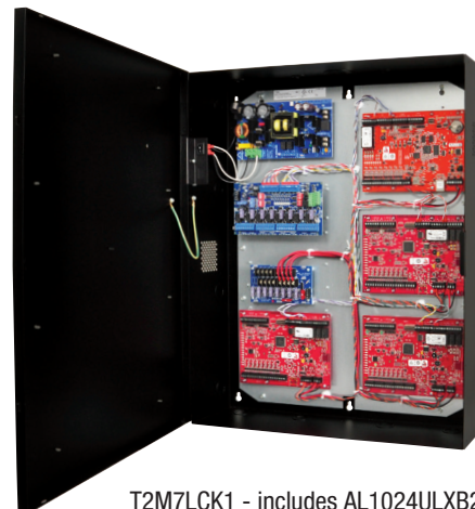
T2M7LCK1 - includes AL1024ULXB2, ACMS8, VR6, PDS8, wire harnesses and wire magnets