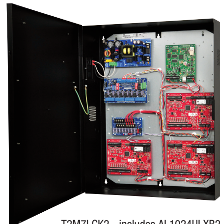
T2M7LCK2 - includes AL1024ULXB2, ACMS8, VR6, PDS8, wire harnesses and wire magnets