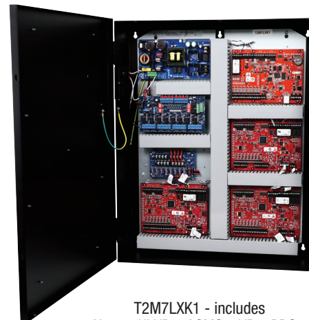
T2M7LXK1 - includes AL1024ULXB2, ACMS8, VR6, PDS8, wire harnesses and finger duct