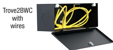
Trove2BWC with wires

Altronix Trove2BWC is a dual-purpose enclosure that can be used as wiring trough or battery cabinet when mounted above or below of the Trove2 integrated power and access solution. The knockouts on the Trove2BWC have been strategically placed to line up with the Trove2 allowing for easy conduit connections between cabinets. Trove2BWC includes cam locks and 2 tamper switches to ensure access to wiring and batteries is secure.