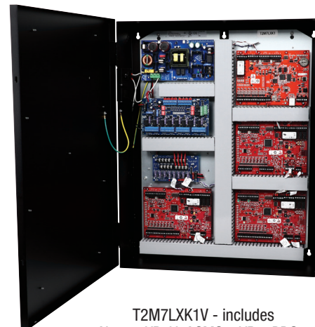
T2M7LXK1V - includes AL1024XB2V, ACMS8, VR6, PDS8, wire harnesses and finger duct