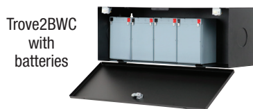
Trove2BWC with batteries

Altronix BR1 mounting bracket is compatible with Altronix Maximal and Trove enclosures. It allows to mount one (1) PD4UL(CB), PD8UL(CB), ACM4(CB), MOM5, VR6, PDS8, NetWay5B or LINQ8PD(CB) sub-assembly on the enclosure's inside wall, saving valuable space.