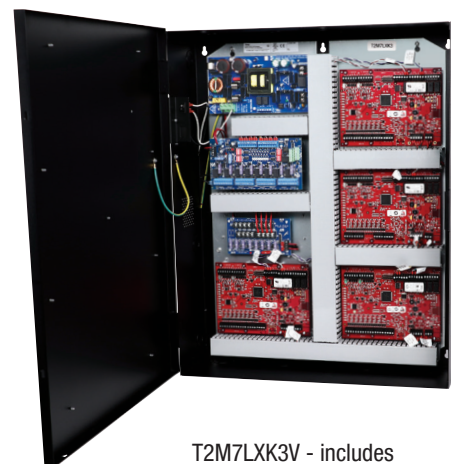
T2M7LXK3V - includes AL1024XB2V, ACMS8, VR6, PDS8, wire harnesses and finger duct