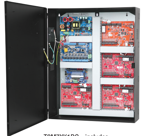
T2M7XK1DQ - includes eFlow104NB, LINQ8ACMCB, VR6, LINQ8PDCB, wire harnesses and finger duct

AccessNsite, Avigilon, BadgePass, BluBox, Feenics, Genetec, Identicon, IMRON, Johnson Controls, Kastle, Keri Systems, Lenel/S2, LockState, Maxxess, Midpoint Security, NLSS, Open Options, Panasonic i-PRO MonitorCast, Quintron, RS2, S2 Security, Schneider Electric, Vanderbilt