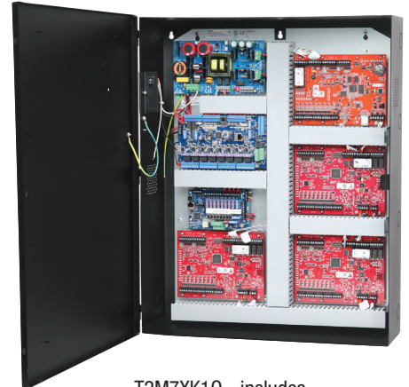
T2M7XK1Q - includes eFlow104NB, LINQ8ACM, VR6, LINQ8PD, wire harnesses and finger duct

AccessNsite, Avigilon, BadgePass, BluBox, Feenics, Genetec, Identicon, IMRON, Johnson Controls, Kastle, Keri Systems, Lenel/S2, LockState, Maxxess, Midpoint Security, NLSS, Open Options, Panasonic i-PRO MonitorCast, Quintron, RS2, S2 Security, Schneider Electric, Vanderbilt