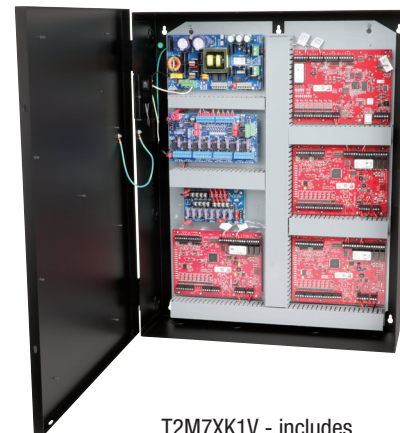
T2M7XK1V - includes eFlow104NBV, ACMS8, VR6, PDS8, wire harnesses and finger duct