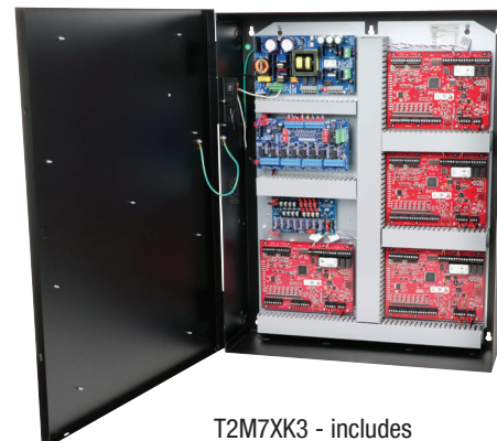
T2M7XK3 - includes eFlow104NB, ACMS8, VR6, PDS8, wire harnesses and finger duct

AccessNsite, Avigilon, BadgePass, BluBox, Feenics, Genetec, Identocard, IMRON, Johnson Controls, Kastle, Keri Systems, Lenel/S2, LockState, Maxxess, Midpoint Security, NLSS, Open Options, Panasonic i-PRO MonitorCast, Quintron, RS2, S2 Security, Schneider Electric, Vanderbilt