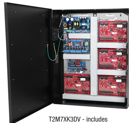
T2M7XK3DV - includes eFlow104NBV, ACMS8CB, VR6, PDS8CB, wire harnesses and finger duct