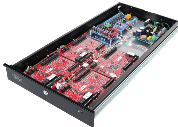
T2RM7CK1DQ - includes eFlow104RLB, LINQ8ACMCB, VR6, PDS8CB wire harnesses and management

AccessNsite, Avigilon, BadgePass, BluBox, Feenics, Genetec, Identocard, IMRON, Johnson Controls, Kastle, Keri Systems, Lenel/S2, LockState, Maxxess, Midpoint Security, NLSS, Open Options, Panasonic i-PRO MonitorCast, Quintron, RS2, S2 Security, Schneider Electric, Vanderbilt