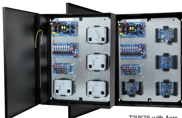
T2VK78 with Aero boards in cases