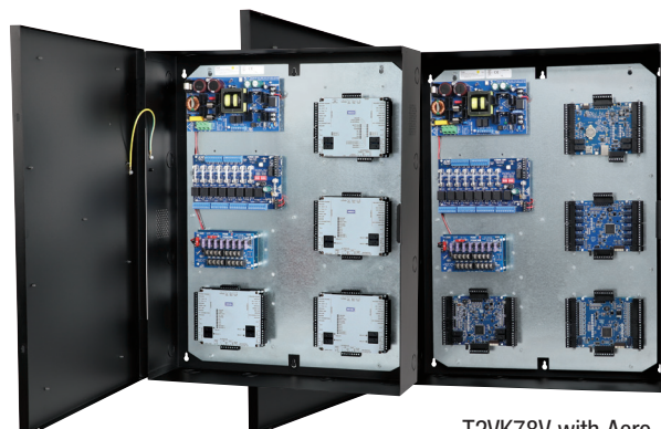
T2VK78V with Aero boards in cases