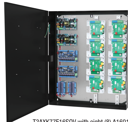
T3AXK77F16SQV with eight (8) A1601 DIN Rail is not included

Axis Communications boards are not included