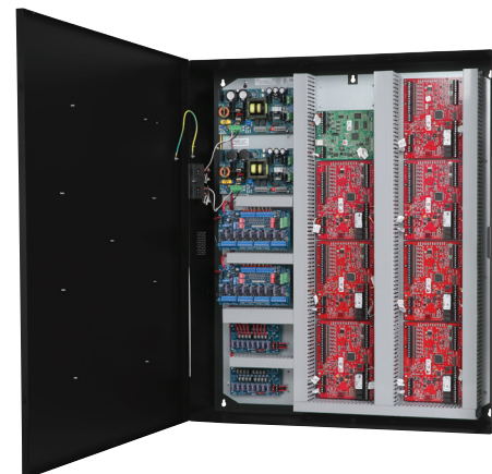
T3M77XK2 - includes (2) eFlow104NB, (2) ACMS8, (2) VR6, (2) PDS8, wire harnesses and finger duct