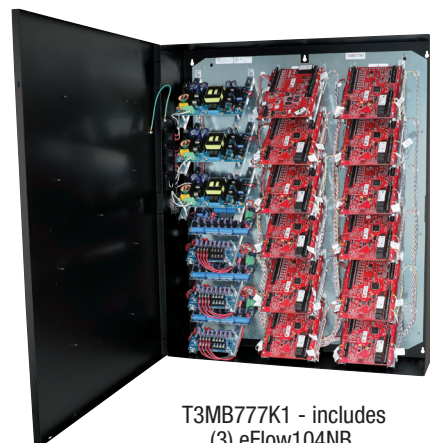
T3MB777K1 - includes (3) eFlow104NB, (3) ACMS8, (3) PDS8, wire harnesses and management