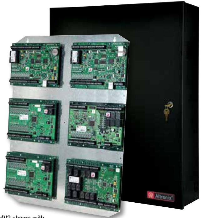
TMV2 shown with optional Mercury boards