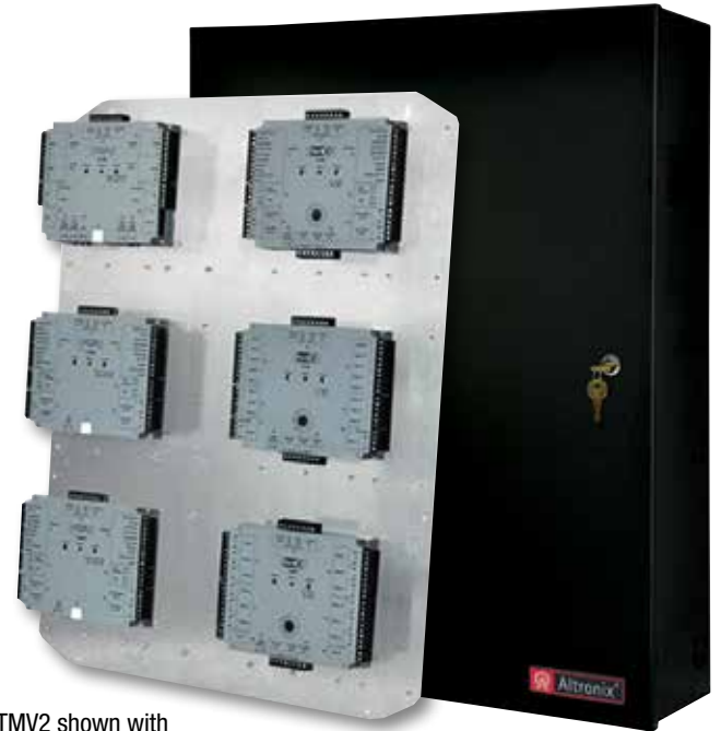
TMV2 shown with optional HID VertX® boards