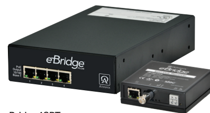
eBridge4SPT and eBridge100SPR

Altronix eBridge4SK kit consists of eBridge100SPR and eBridge4SPT Coax to CAT-5 Ethernet adapters/media converters that deliver data and power over coax cable. The paired set enables fast 10/100 Base-T Ethernet digital communication. eBridge4SPT allows to upgrade the existing infrastructure by replacing a single analog device with up to four (4) PoE/PoE+ devices. eBridge100SPR passes data and sends power over the coax to the eBridge4SPT. Data transmission and power over the Coax are possible up to 300m. Maximum range from headend to the PoE camera/device is 500m, taking into consideration that up to 100m of structured cable may be deployed at each end. eBridge4SK enables cost-effective system upgrades and eliminates the costs and labor associated with installing new network cabling.